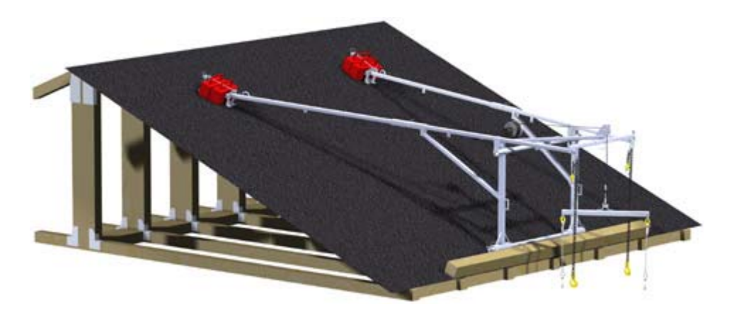
Model SC-300-cb can be safely installed on roofs with slopes of up to 5:12

The arrangement of the weight beams gives the Roofer Hoist some special advantages: Because they are splayed apart, the hoist is very stable. Also, the weight beams are angled away from the roof deck, so they act as side guardrails towards the front of the hoist. These side guardrails help protect the worker from falls as he approaches the edge of the roof. As well, the weight beams only contact the roof deck in a 3 places, so roofing tear-offs can proceed with the hoist in place.