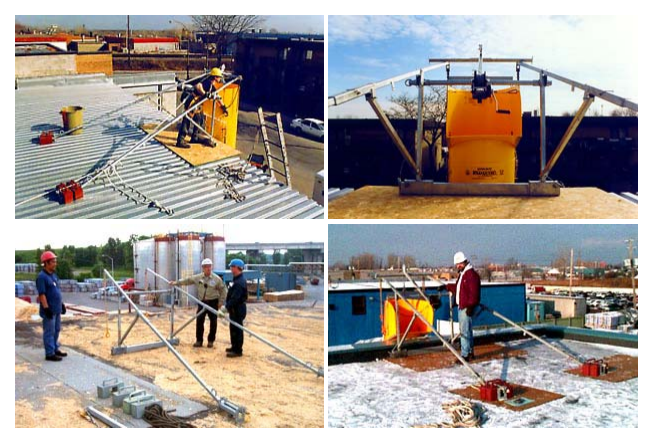
Click this image for a close-up.