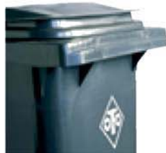
Lid with lip handle