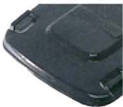
Lid with bow-type handle