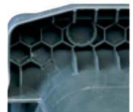
Deeper combs ensure optimum accommodation on the lifting device