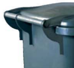
Handle bar, diameter 30 mm